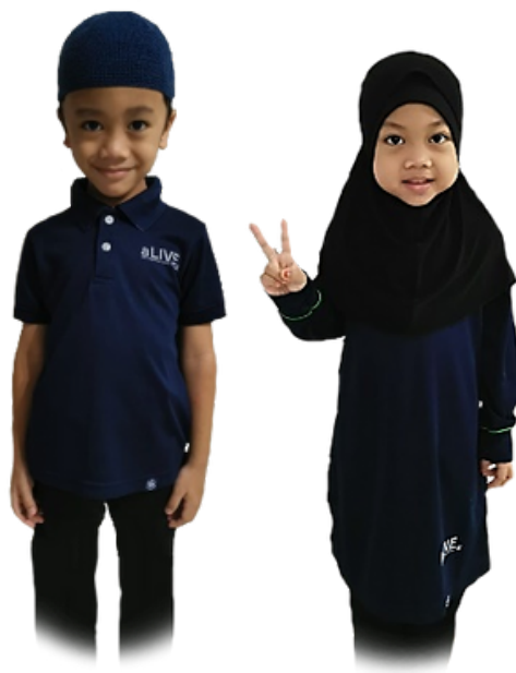
Fig 2.1 Male and female students' attire

For female students, they can pair with their own black pants and black headscarves. Tight-fitting pants or leggings are not appropriate for madrasah.